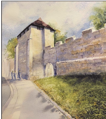
"Fishergate Postern Tower"

Friends of York Walls lease the tower from the City of York Council. Displays here are about the tower and the history of the City Walls. Entry is free on our open days, and we can also open for payment. Planned Open Day dates are listed in the next column. For £20, you can "Sponsor a Stone" in your name or for someone else – you choose a stone on an external wall of the tower, then a certificate and book entries link that stone uniquely to the name you give [the next column explains how to sponsor your own stone]. Currently we need money for better displays, and for running costs. Please help FOYW to carry on returning the tower to fuller community use.