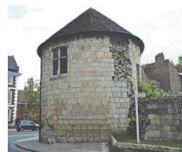
St Mary's Tower (in the Abbey's defensive walls)

Friends of York Walls Charity Number 1159300